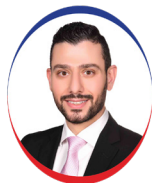
Shadi Al-Bahri Tawam Hospital UAE