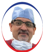
Thamir Alkassab Al Zahra Hospital UAE