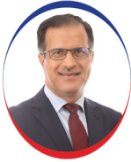
Manaf Al Hashimi Burjeel Hospital UAE