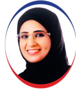
Laila Alhubaishi Latifa Women & Children Hospital UAE