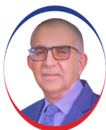
Muwafak Salman Tawam Hospital UAE