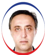
Wael Toson Saqr Hospital UAE