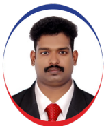
Sano Vasu Mediclinic Middle East UAE