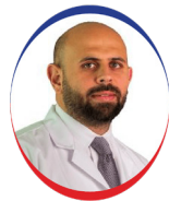
Mohammed Shahait Al Zahra hospital UAE