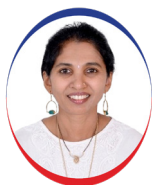
Anu Bondili Tawam Hospital UAE