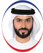
Abdulla Al Hammadi Tawam Hospital UAE