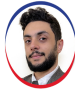
Abdulla Nidal Rashid Hospital UAE