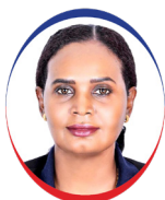
Rehab Omer Al Noor hospital group UAE