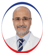
Omer Al Derwish Fakeeh University Hospital UAE