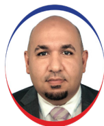
Wissam Kamal King Fahad General Hospital KSA