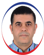
Emad Elsobky Wellness One Day Surgery Center UAE